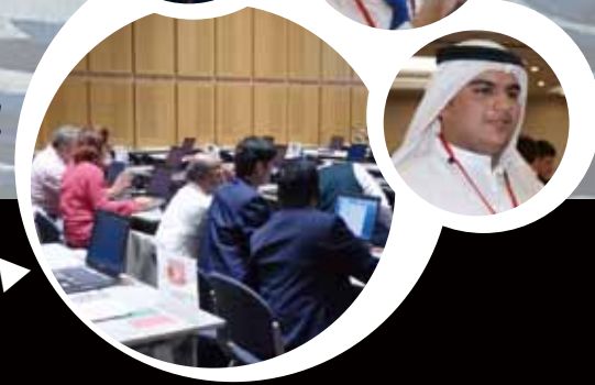
Jury session ▶