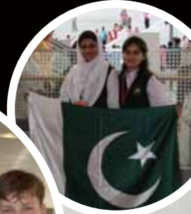
Team Pakistan ▶