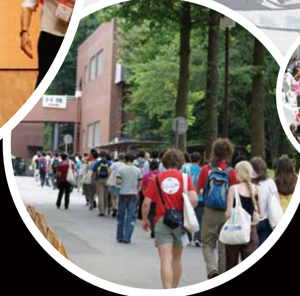
▲ Participants arrived for the orientation at University of Tsukuba.

Team Korea: We are very motivated! We cannot guess what kind of questions will come up, but we are not so nervous about it. We have been working hard, so we think we can gain what we deserve. But we will try our best. We are also looking forward to talking with other participants after the exam so that we can exchange opinions and make new friends.