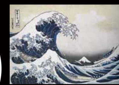
"Kanagawaoki Namiura" by Katsushika Hokusai

cultures could be seen together. Apart from competing, this is what IBO is all about: meeting people from all over the world and making new friends!