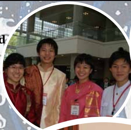
Team New Zealand