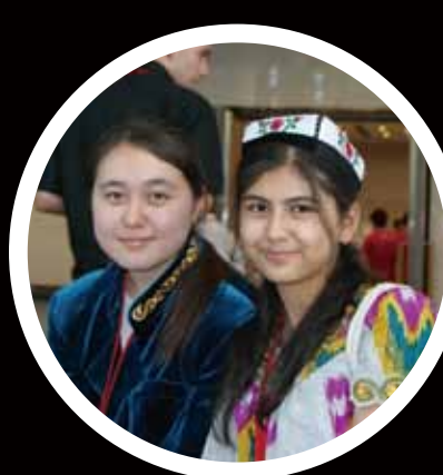
▲ We made new friends!

This picture is an ukiyoe wood-block print named "Kanagawaoki Namiura" made by Katsushika Hokusai. Ukiyoe prints show scenes of everyday life in the Edo period (1603-1868). This is one of the famous works included in "Thirty-six Views of Mt. Fuji". It portrays waves off the coast of Kanagawa prefecture, with Mt. Fuji behind. It is said that Hokusai had great difficulty in sketching this picture because the waves were moving, and the curves needed to be described in fine detail. So this is a masterpiece that took him half a year.