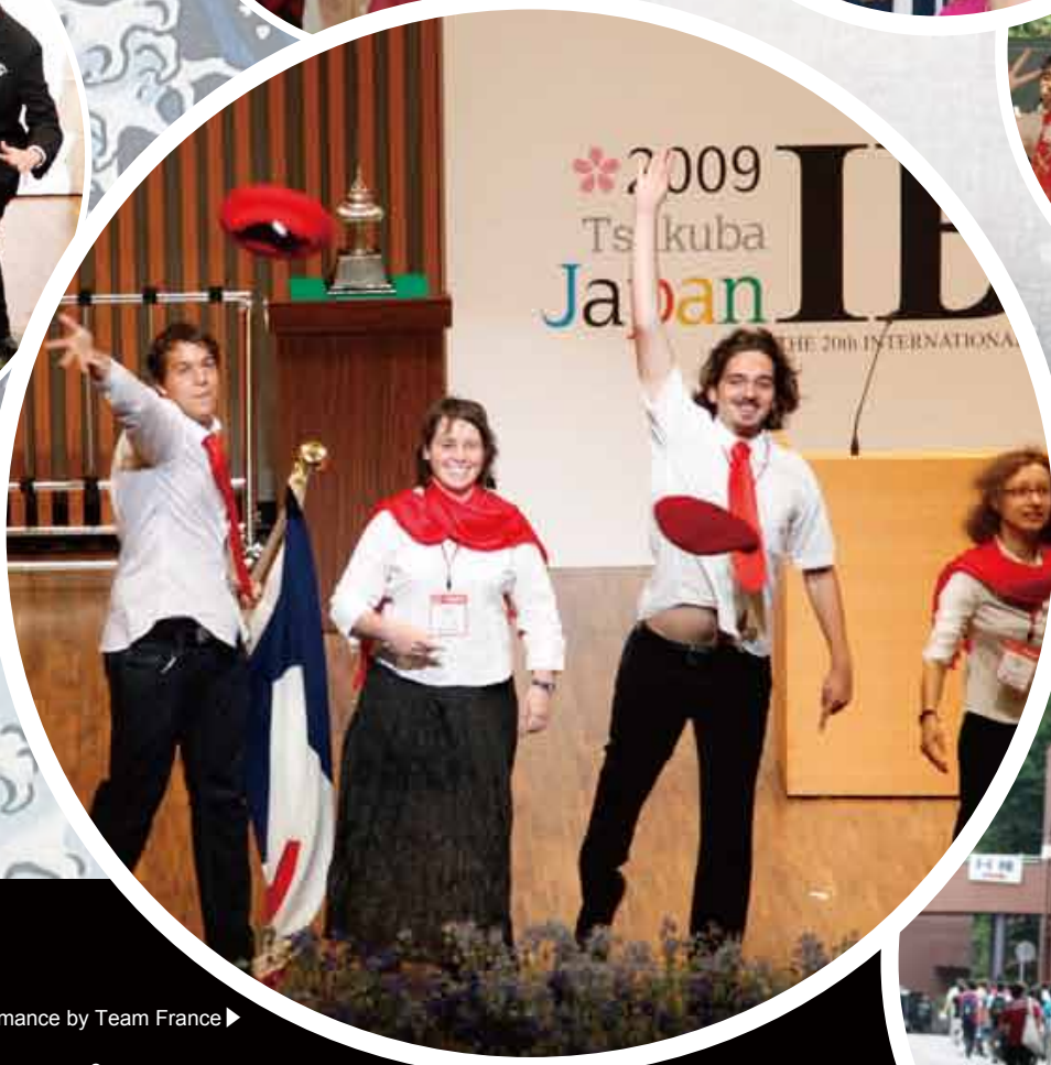
Throwing hats --- entertaining performance by Team France ▶